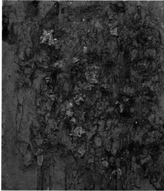
Figure 0.3 Saburo Murakami, Peeling Picture , 1957. Oil on canvas, 20 7/8 x 17 15/16 in. (53 x 45.5 cm). Collection Axel & May Vervoordt Foundation, Belgium