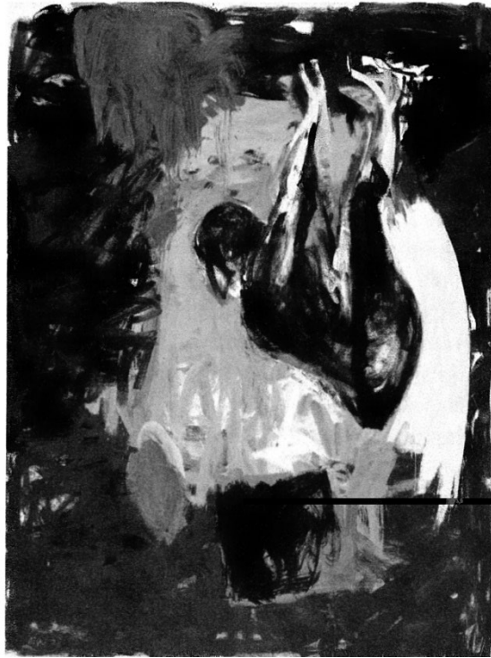
Figure 0.1 Georg Baselitz, Die Ahrenleserin (The Gleaner) , 1978. Oil and egg tempera on canvas, 129/8 x 98% in. (330.1 x 249.9 cm). Solomon R. Guggenheim Museum, New York. Purchased with funds contributed by Robert and Meryl Meltzer, 1987. © Georg Baselitz 2022, Artwork photo: Friedrich, Rosenstiel, Cologne, Courtesy Archie Georg Baselitz