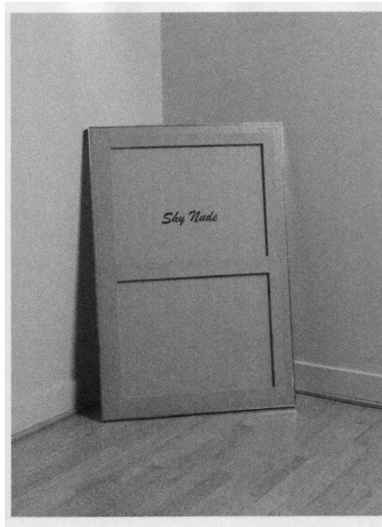
Figure 0.2 Fiona Banner, Shy Nude , 2007. Graphite on paper with spray paint and aluminum frame. Frame: 50 1/2 x 34 3/4 in. (128.3 x 88.3 cm). Richard Brown Baker Fund for Contemporary British Art, 2009.11 © Fiona Banner. Courtesy of the artist and the RISD Museum, Providence, RI